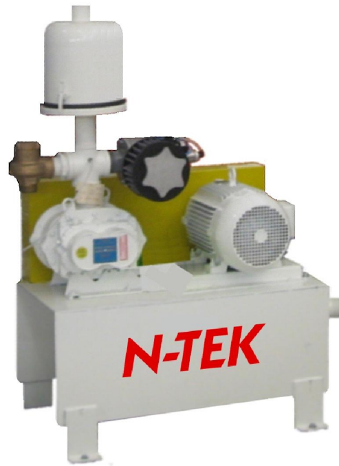
10 HP VACUUM PUMP

N-Tek's highly efficient central vacuum pumps are built with components of the highest quality and designed to provide years of trouble free operation. Each unit is complete with: